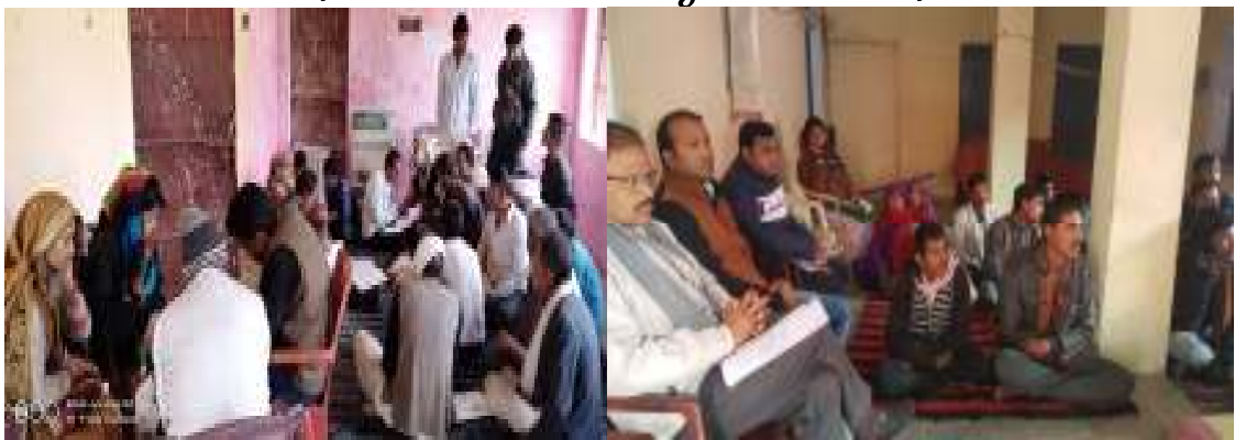
(GP MUARI and GP lohari)