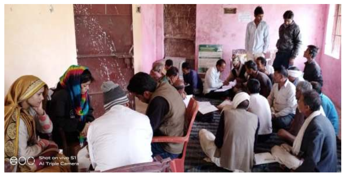
Gram Sabha Meeting in MUARI GP